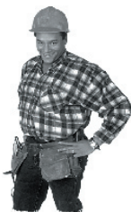
Dignified People Help Others.

Honesty is showing fairness and sincerity toward one's neighbor without lying, cheating or stealing. Serving an employer honestly and with sincerity of heart means that one makes every effort as an employee to make his employer successful. Dignity is being honest and sincere in what one does in his or her relationship with others. A manpleaser is one who does something with an insincere heart in order to accomplish a selfish goal. But one who serves with sincerity does his service from the heart in order to serve another.