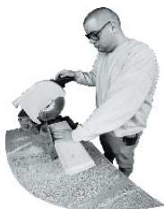
One Works In Order To Help.

3. The dignified person works in order to help the poor. One purpose for our working is to share what we earn with others. In order to show appreciation for our work, we seek to give to others. Only through giving to others do we build our character. Selfish labor leads to a greedy heart. Those who understand that they do not work only for themselves, but also for their fellow citizen, will develop caring hearts. When one has work, therefore, he or she must not forget those who cannot find work. Those who conduct themselves with dignity have compassion on those who are suffering from economic depression. It is always the responsibility of society as a whole to take care of society as a whole. Democracy can exist in a nation only when citizens unselfishly work together in the free economic structure of the nation. Each person must be responsible for providing for himself and his family. But we must also be concerned about those who are the poor among us (See Galatians 2:10).