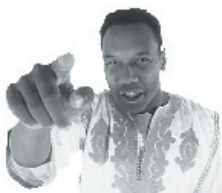
Our Speech Reveals Our Hearts.

commandments refer to dealing with one's relationship with his or her neighbor by respecting one's neighbor. Those who violate these commandments do not love their neighbors as themselves. They are not people of dignity. The person of dignity, however, will make every effort to live with his or her neighbor by not violating the rights of one's neighbor.