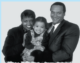
Love Connects Husbands To Wives.

The Bible teaches, “But if anyone does not provide for his own, and especially for those of his own household, he has denied the faith and is worse than an unbeliever” (1 Timothy 5:8). Any God-