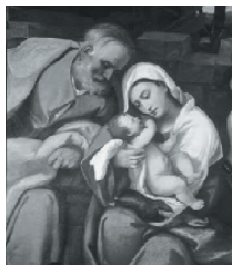
Headship Means Security & Protection.

Almost all faiths of the world teach that in the union of marriage the husband is the head of the wife. However, we often misunderstand the meaning of the husband being the head of the wife. When we think of the husband's headship in the family, we often think only of his control of the family. In many ways, the husband is in control. But there is more to the headship of the husband than just control.