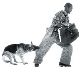
Dignified People Respect The Property Of Others.

The one who steals from his or her neighbor does not respect others. The thief is always selfish. He or she has no consideration for the hard work of others who labor with their own hands to acquire what he steals from them. There is no such thing as a dignified thief.