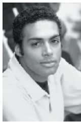
The Dignified Person Does Good To Others.

Dignity refers to the development of our character in a manner that results in being respected by others because of our honest conduct of life. It refers to the manner by which we conduct ourselves in our relationships with other people. Similar in meaning to dignity is integrity. Integrity is the state of being of a sound moral principle. It is a character of uprightness, honesty and sincerity. The dignified person conducts himself with great integrity.