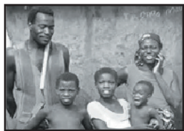
Christian Fathers And Husbands Nurture Their Families.

FATHERS must lead in establishing correct family relationships. In the father's relationship with his children, he gives an example of loving understanding and tender care for the innocent. Children with loving fathers grow up without being hard and harsh in their relationships with others. They show respect for authority and the lives of others. A father's relationship with his children,