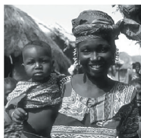
Loving Parents Create Loving Children.

The family is a God-created institution. In the family, children learn principles and personality skills by which they can live in society. It is also in the family that children develop their characters. It is important, therefore, that fathers and mothers take special care in teaching their children relationship and behavior skills that are based on the sound moral and ethical principles of the word of God.