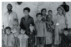
The Foundation Of Social Morality Is Formed In The Family.

The foundation for good communities depends on the good relationships that are established between men and women in marriage. If the relationships between husbands and wives are not established upon fundamental principles of moral stability, society as a whole pays the price. Almost all problems in any society are directly linked to problems in the home. And since the home is the responsibility of husbands and wives, the solving of community problems must focus on solving problems in husband/wife relationships. In order to save our children from great heartache in life, fathers and mothers must accept the responsibility of creating a loving home environment for the development of their children.