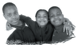
Always Have Christian Friends.

All that we know about the early childhood of Jesus is mentioned by Luke when he recorded an incident that happened in Jesus’ life when He was about twelve years old. One time when the parents of Jesus were returning after a feast in Jerusalem, Jesus stayed behind in order to carry on with His heavenly Father’s business. After the parents returned to