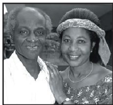
Marriage Is A Commitment Of Two People To One Another.

only one woman. When a man makes this level of commitment in marriage, then in the eyes of God, the man and woman become one. In marriage, two people bring their worldly goods together into one ownership. But they also bring their two personalities together to create for both a new world in which the two exist as one in the eyes of God. It is for this reason that a man must leave his parents and cleave to his wife in order to nourish and cherish only her as his wife.