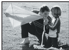
Good Fathers Interact With Their Children.

God's pattern for fathers and mothers is that they teach and demonstrate in their lives honorable ways of life for their sons and daughters to follow. Through the father's loving relationship with the mother of his children, he sets an example of how one should care for others. Because of his love for his wife, he demonstrates to his children how they must behave toward their future wives. The mother's loving concern for her husband and children produces a home environment where happiness is guaranteed for future families.