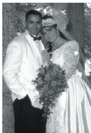
Husbands And Wives Commit Their Love To One Another.

William Penn once wrote, “Between a man and his wife nothing ought to rule but love.” The extent of the husband’s love for his wife is explained in the words of the Bible that husbands “ought to love their own wives as their own bodies” (Ephesians 5:28). As one should take care of his own body, so the husband should take care of his wife. It is for this reason that drunkards or drug addicts cannot love their wives as they should. They do not take care of their own bodies, and thus, they do not take care of their wives.