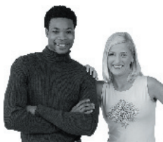
People Of Dignity Respect Others For Who They Are.

It should be the challenge of every person to discover skills for developing a dignified life of integrity. In