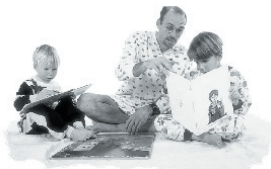
Christian Families Have Common Moral Values.

When speaking in the context of worries about the possessions and circumstances of the world, Jesus encouraged us by saying, “Seek first the kingdom of God and His righteousness, and all these things will be added to you” (Matthew 6:33). It is only reasonable to believe that those who seek to maintain a spiritual life will enjoy the best of this life.