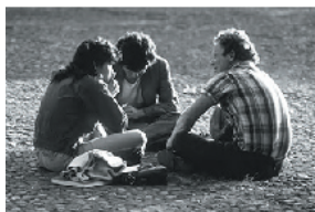
Discuss Bible Subjects.

The parents of Jesus asked why He stayed behind. He responded, “Why is it that you were looking for Me? Did you not know that I must be about My Father’s business?” (Lk 2:49). When