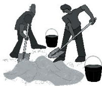
Those Who Work Have Self-Respect.

Because the dignified person works with his or her own hands in order to supply one's necessities, he or she can deal honestly with one's neighbors. When one can take care of oneself, he or she is not tempted to beg from one's neighbor or steal from one's neighbor.