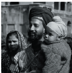
The Family Is The Citizenship Factory For Every Nation.

husband must express a loving attitude toward his wife in order to establish his headship and example for the children. If he does not express a loving relationship toward his wife, then he has failed to offer to the family the spiritual leadership that God intended for the family to have on a daily basis.