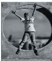
Everyone Wants To Live A Happy Life.

If we seek to develop a nation that is united under belief in God to whom we all will give account, then it will take a great amount of effort. We must be motivated to do what is right in order to establish within our societies principles that will produce the kind of citizenship that builds vibrant nations. Therefore, as one studies through moral and ethical principles that lead to the development of a great person, he or she must realize that we all have a great responsibility as a citizen of our nation to build the nation on morals and ethics that will lead to a better life for everyone. When we do this then we fulfill the dream of everyone, that is to live a happy life.